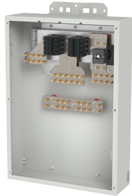
PTS31468-44A-C Internal view (shown with Contactor on right leg)